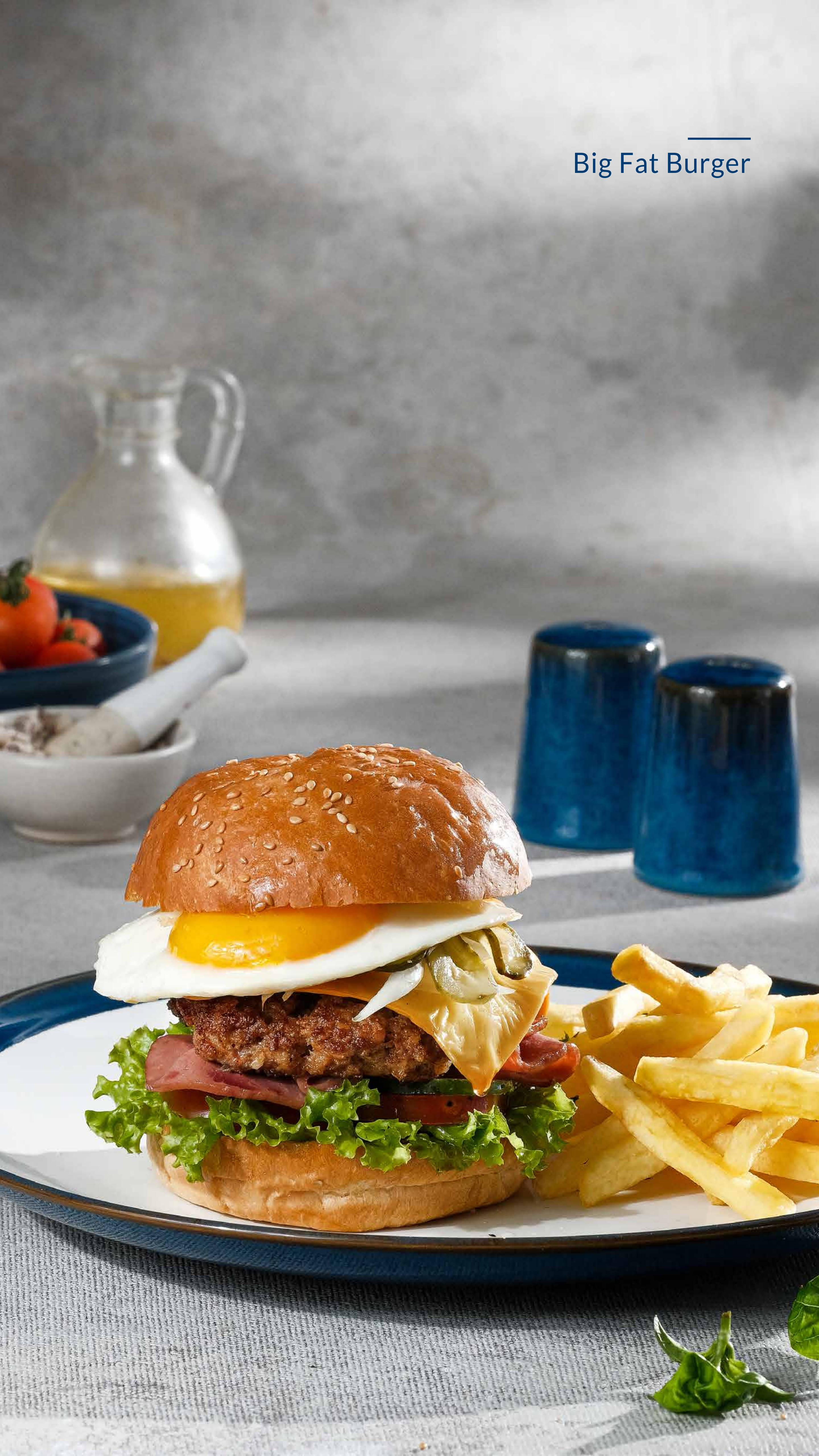
Big Fat Burger