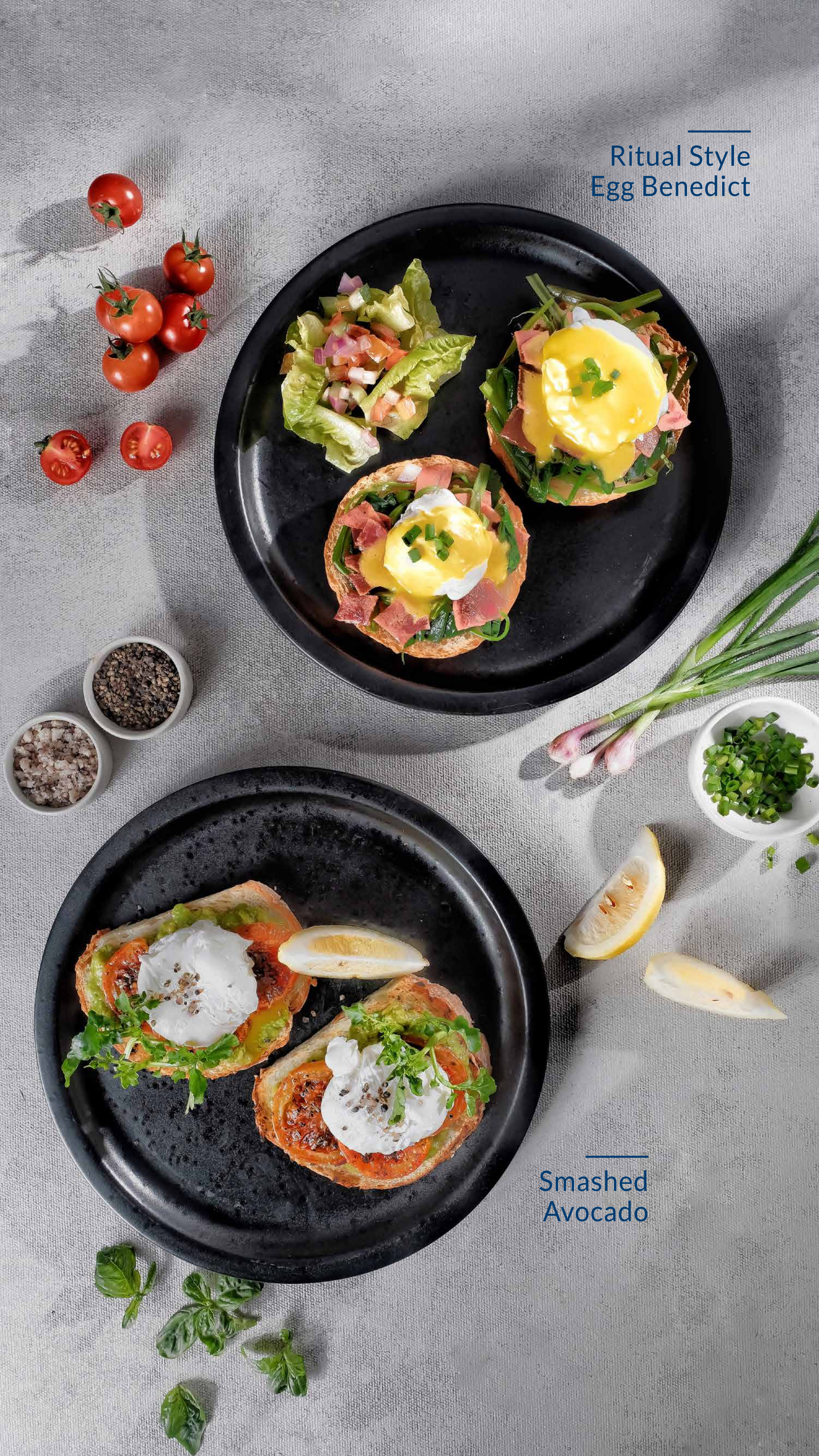
Ritual Style Egg Benedict