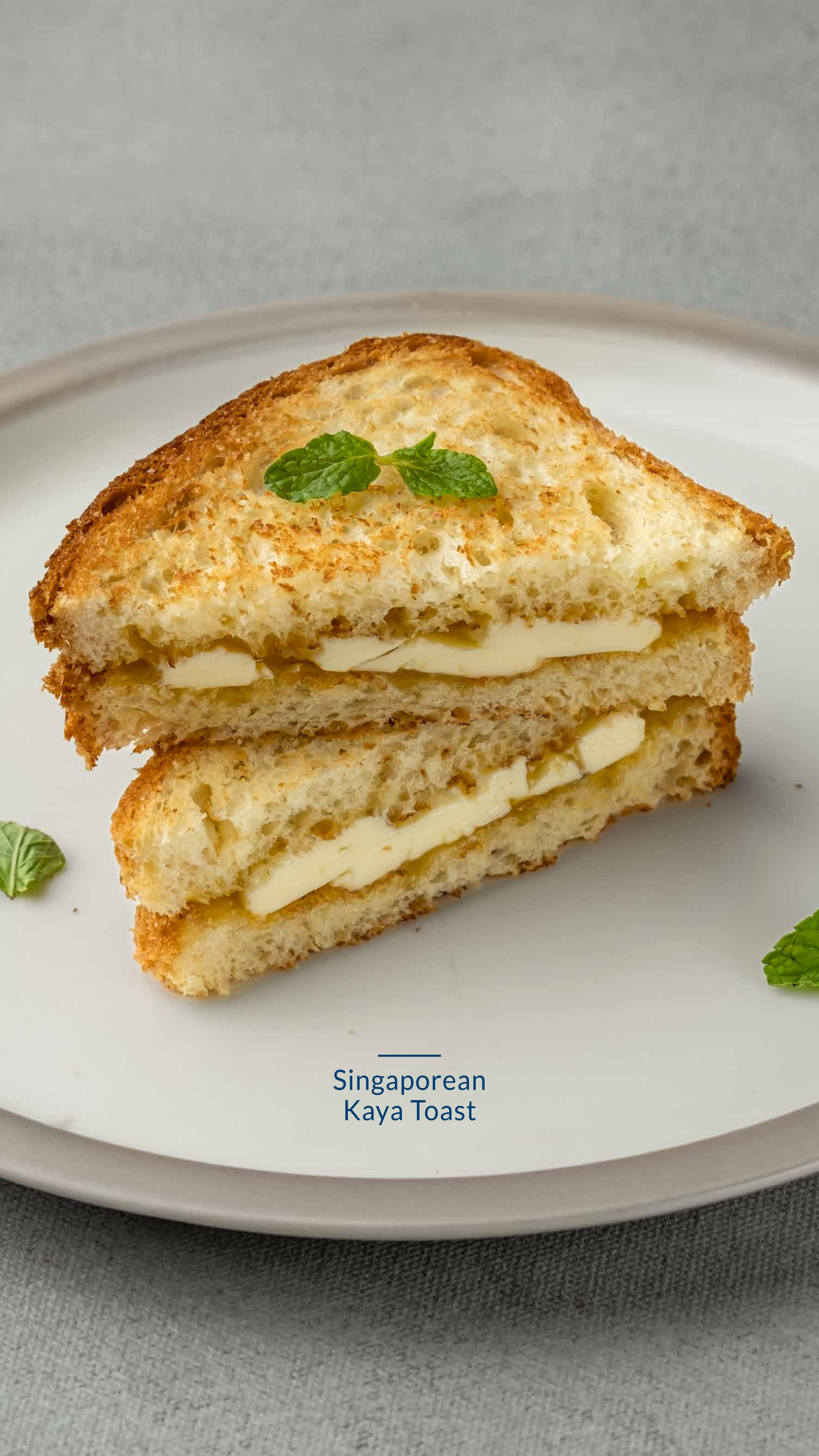
Singaporean Kaya Toast